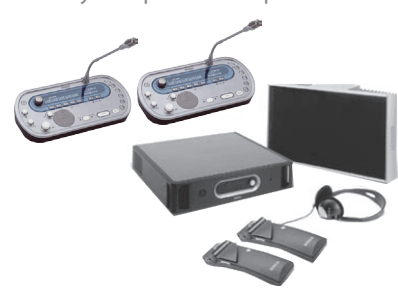
$690/day retail $480/day multi-day rate