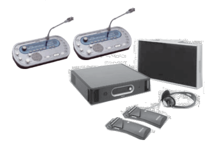
$690/day retail $480/day wholesale